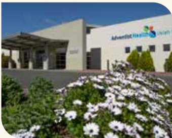
Adventist Health Ukiah Valley

1 Marcela Drive Willits, CA 95490 707-459-6801 AHHoward.org