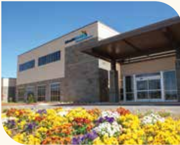
Adventist Health Howard Memorial

1 Marcela Drive Willits, CA 95490 707-459-6801 AHHoward.org